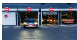
Number Plate Recognition