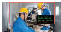
Safety Gear Compliance