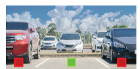
Parking Spot Detection