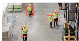
Employee Uniform Detection